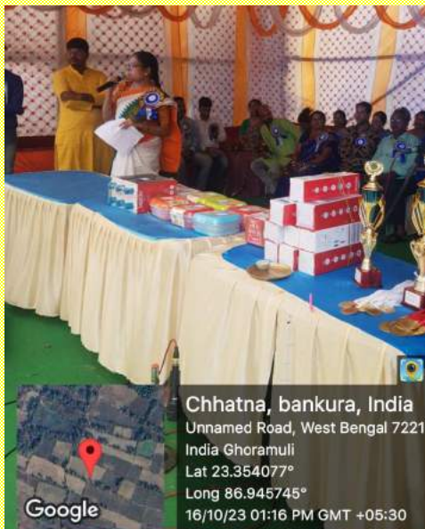
College Annual Sport Prize