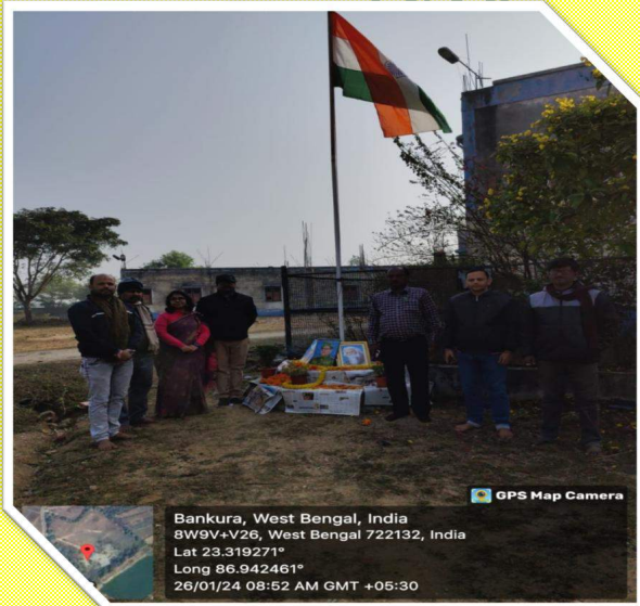
College Observation Day