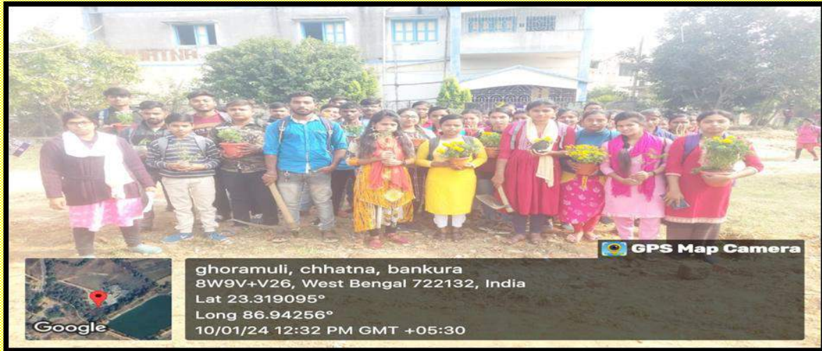
Glimpses of Greenbelt development and Cleaning Programme