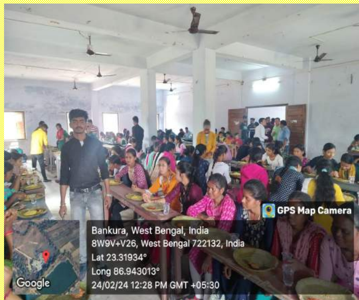
Annual College Picnic